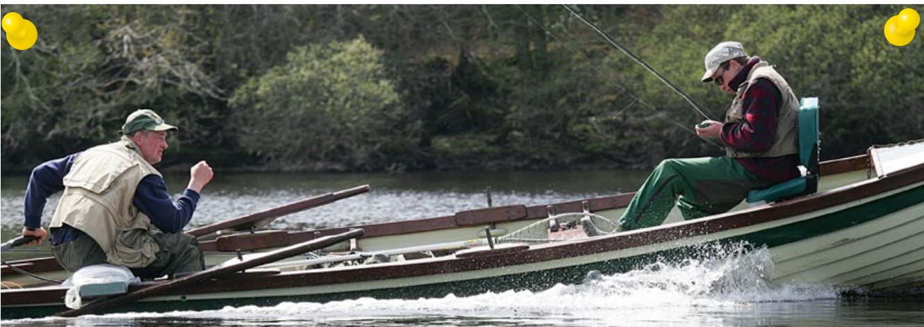
Angling fans are spoiled for choice

Our natural resources are treasured but we like to show them off too! Caragh Lake is the jewel. The lake naturally splits into Upper and Lower levels. The best way to fully appreciate its magnificence is by hiring a boat for a few hours. Afloat on this lake is as close as you'll get to Nirvana - it just has to be experienced. Ask for boat hire information at the tourist office in Killorglin town. Fancy a spot of fishing? No problem. Deep sea fishing tours are available with departures from Rossbeigh and Cromane. Check with the tourist offices for more information or on gokerry.ie. Angling fans are spoiled for choice here. There are so many good spots to choose from. Don't miss out, base yourself here and sample them all. Don't think about what might have been. Some of the potential catches in our rivers and lakes include salmon, sea trout & brown trout. We make full use of our natural resources, and so should you.