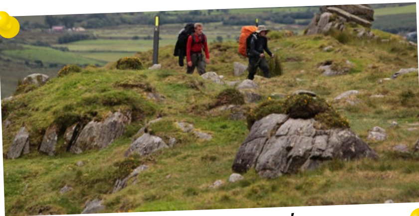
A Walkers paradise