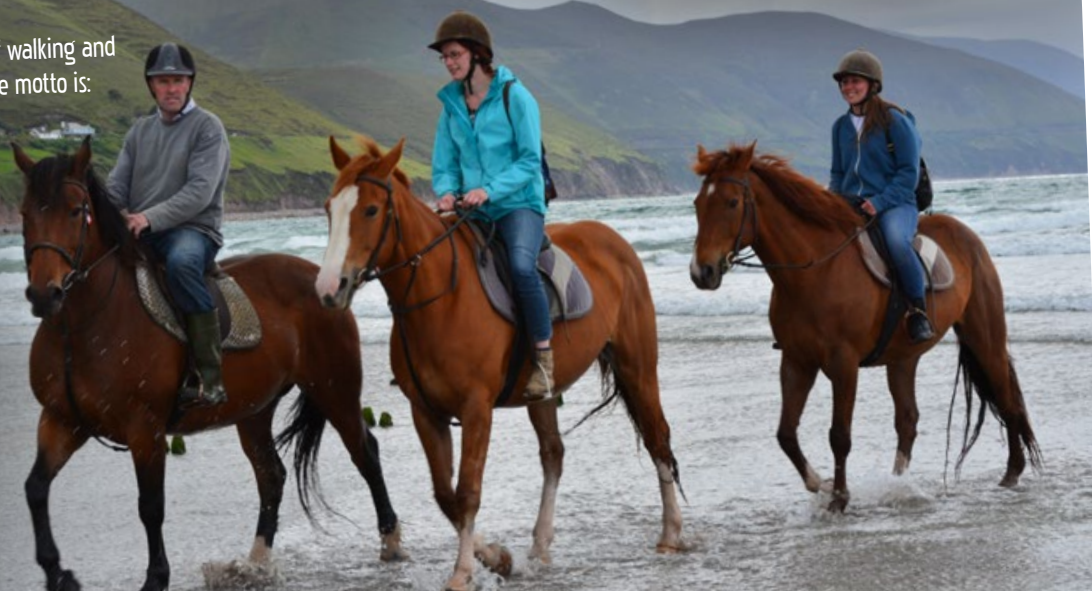
Horseriding on Rossbeigh Beach

No matter what the fitness level, there is something for everyone here. Just look around, it's an outdoor playground. You want beaches? You won't find many better in Ireland than Inch, Rossbeigh and Kells. Fancy some kayaking, rock climbing, orienteering or sailing? No problem. There's Cappanalea, an outdoor activities centre, situated on the Killorglin side of the glorious Caragh Lake. The surfing world has recently unraveled a great Irish secret. Experience it for yourself at Inch beach, where surf schools will cater for beginners. There's an abundance of walking and cycling opportunities. The motto is: just hit the road and see where your legs carry you. Fascinating forest walks await at Lickeen in Glencar; Kilderry in Milltown; Tomies in Beaufort, and Rossbeigh. All will enthral. Horseriding you say? Yep, there's Burke's in Rossbeigh, and Ardall, in Castlemaine.