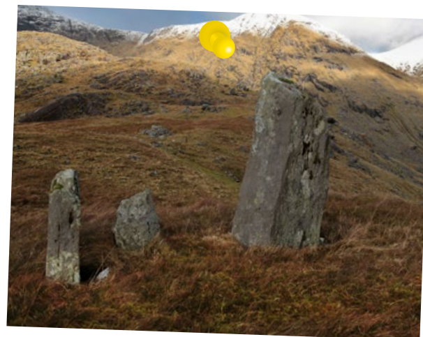
Old Stone Alignment